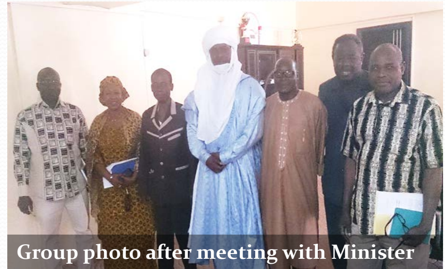
Group photo after meeting with Minister

Remaining Issue: How to get BCR/ABL test kits????