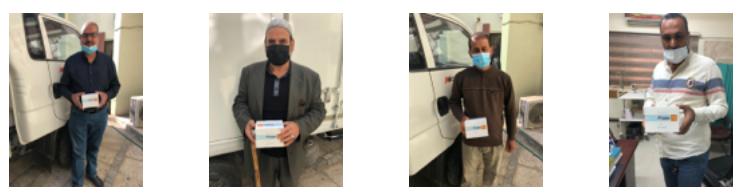
Smiling faces - Relieved Iraqi patients after having been handed over their treatment.

We wish to take the opportunity to thank all members of the CML Advocates Network and CML-CAB involved in the process for their great work and engagement, and of course to Novartis for reacting to our pledge!