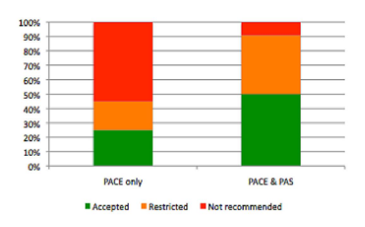
Figure 14: SMC recommendations including PACE deliberations, with and without PAS