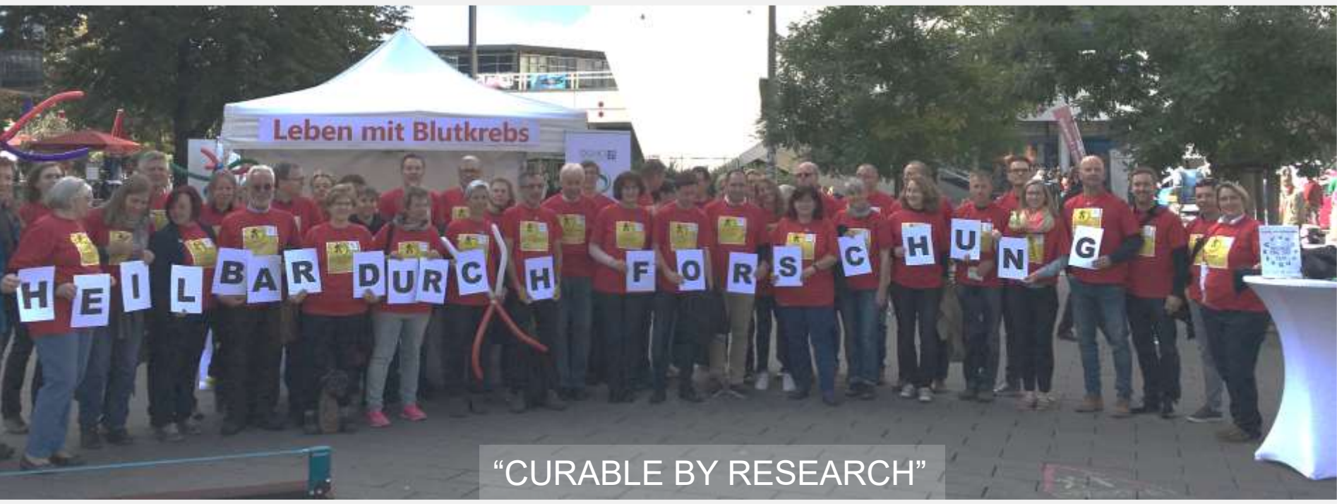
“CURABLE BY RESEARCH”